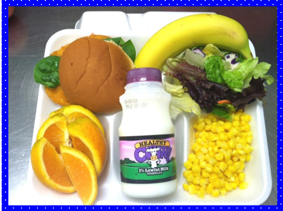
1. Fruit 2. Vegetable 3. Milk 4. Meat 5. Grain